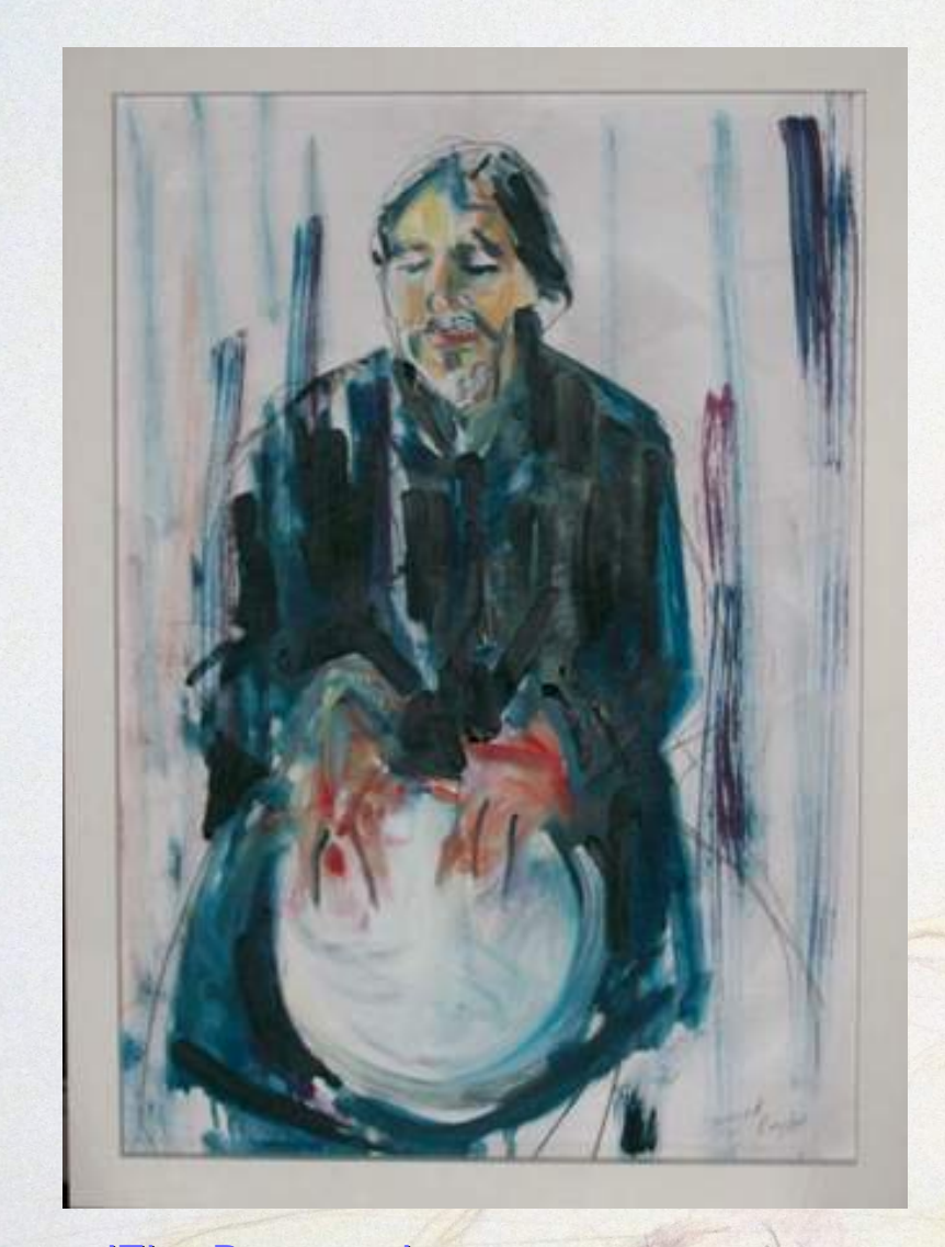
'The Drummer' oil on board 470mm x 640mm $1200