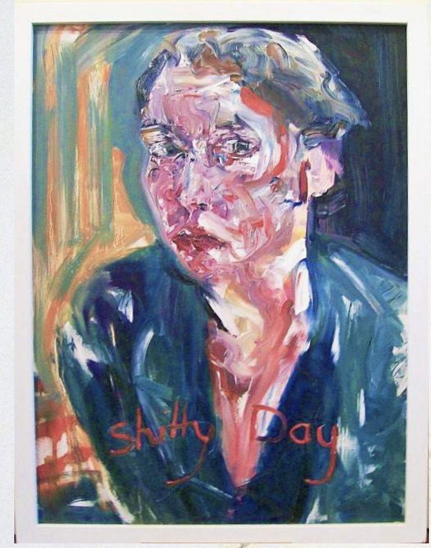
'Shitty Day' 'oil on board ' 420mm x 500mm $1200