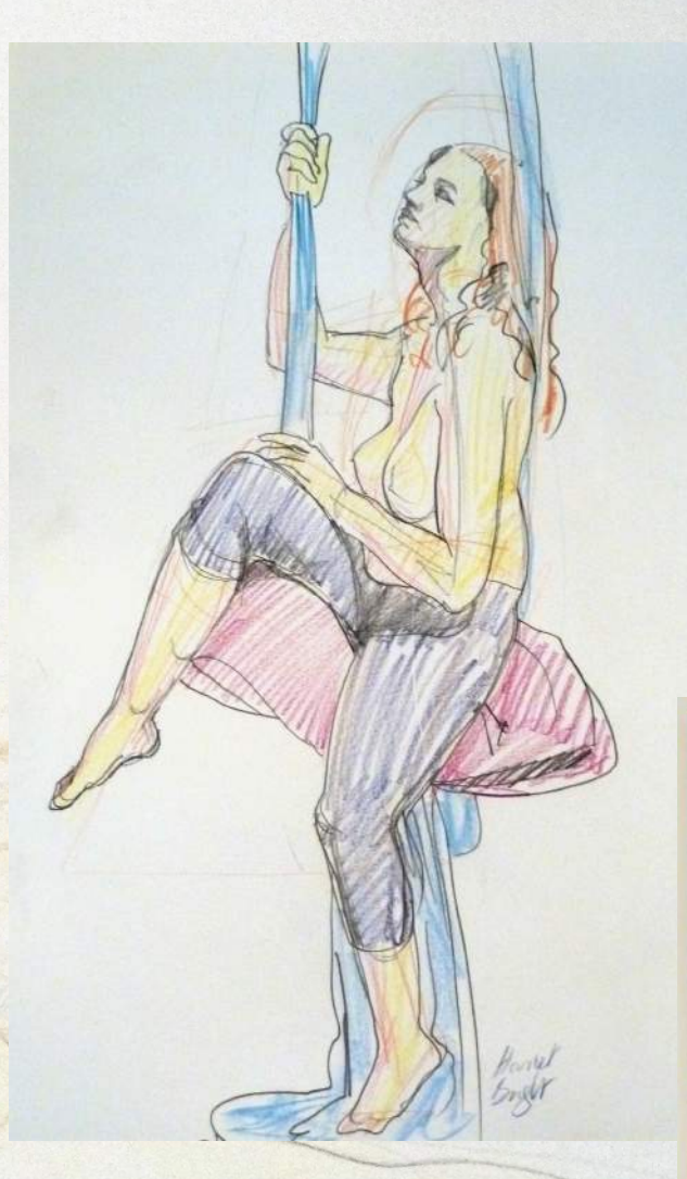
'The Acrobat' coloured pencil on paper 480mm x 620mm $700