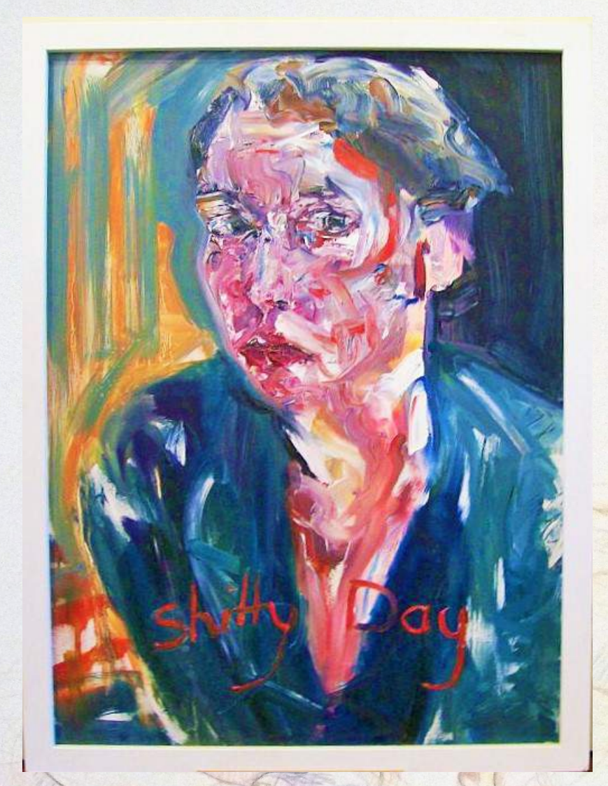
'Shitty Day' 'oil on board ' 420mm x 500mm $1200