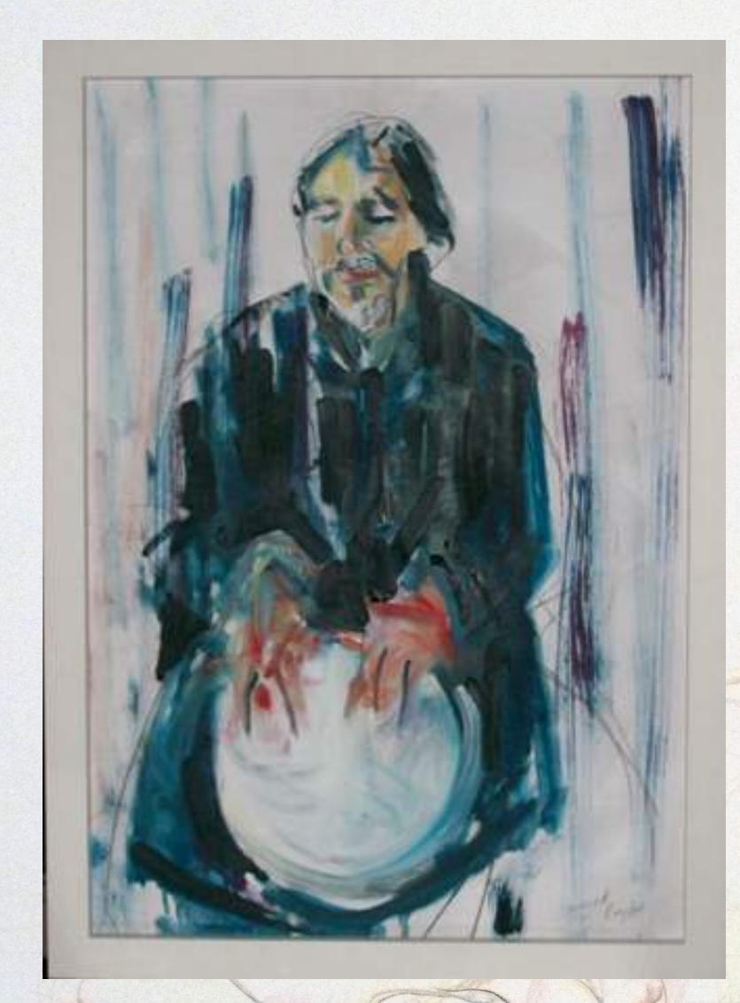
'The Drummer' oil on board 470mm x 640mm $1200