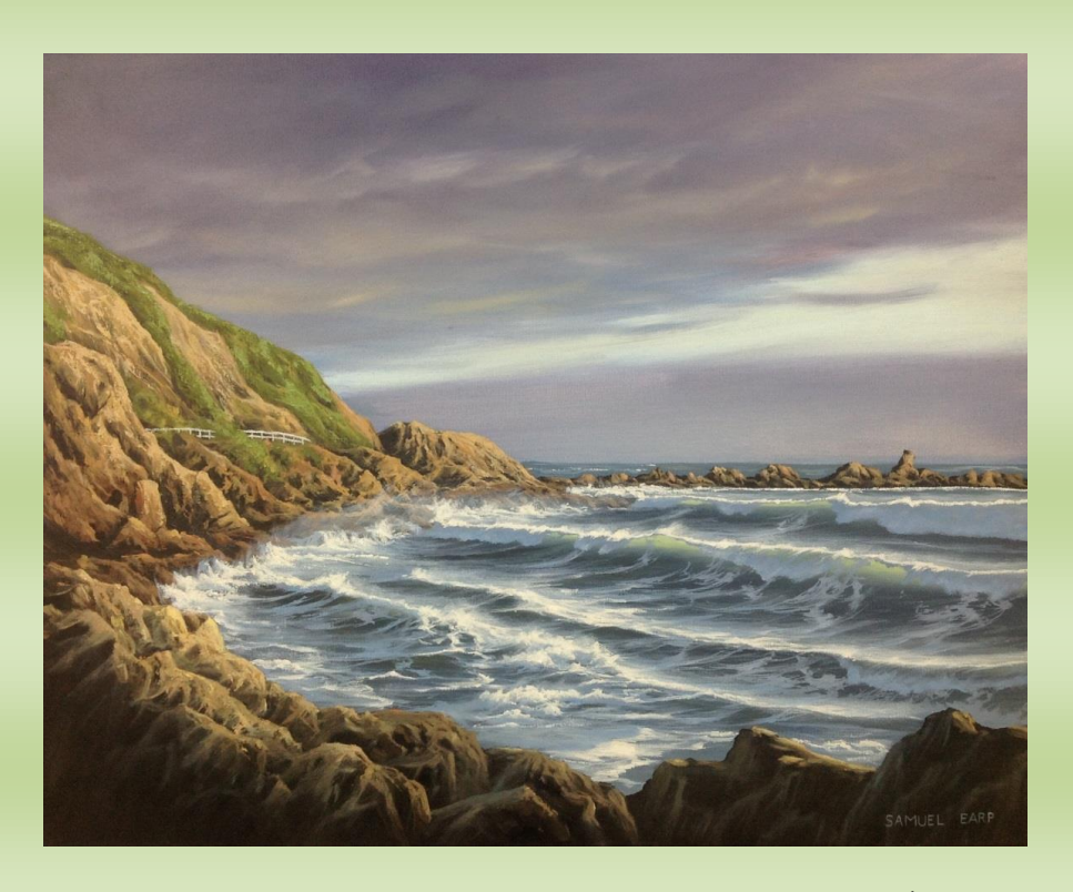
'Summer Evening Houghton Bay' oil on canvas 900mm x 600mm $2200.00