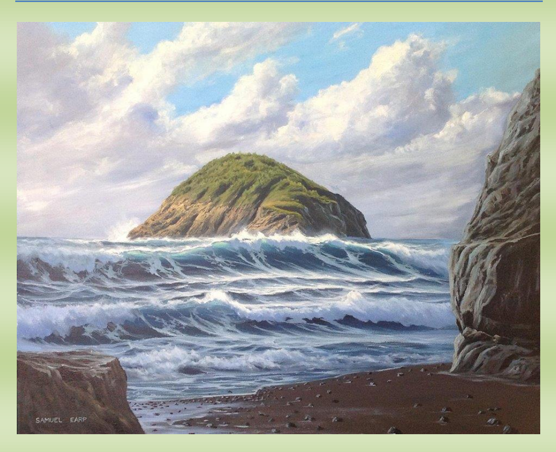
'Motuotamatea Island' oil on canvas size 750mm x 600mm $1700.00

Cover – 'Wave Study West Coast' oil on canvas 550mm x 450mm $1550.00