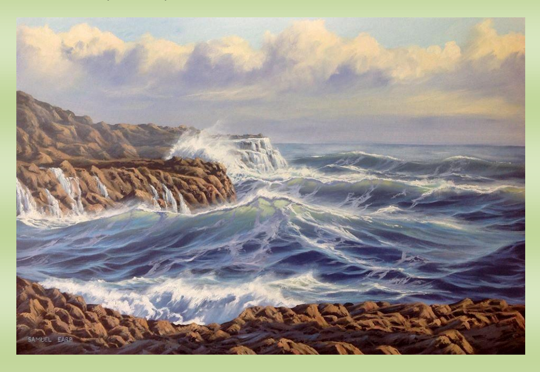
'Breaking Waves Whites Beach' oil on canvas 900mm x 600mm $2200