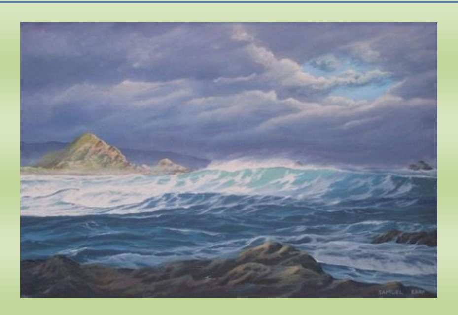
'Island Bay Storm' oil on canvas 820mm x 590mm $1200