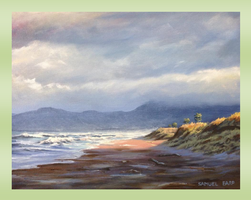
'Bay of Plenty Coast' oil on canvas 300mm x 250mm $500.00