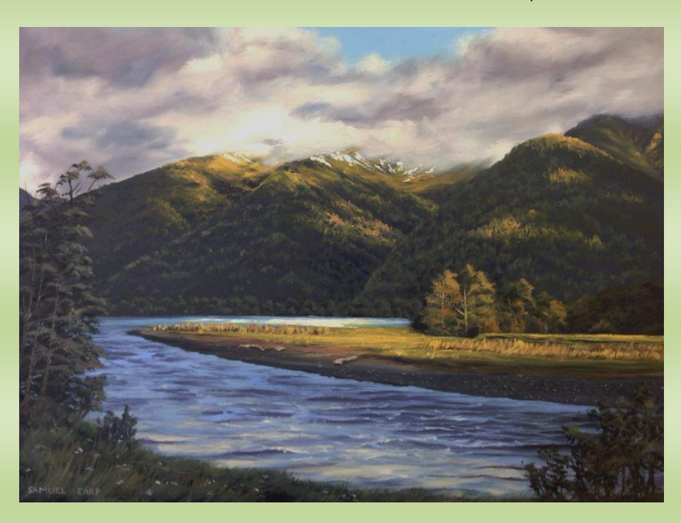
'Haast West Coast' oil on canvas 600mm x 460mm $1450.00