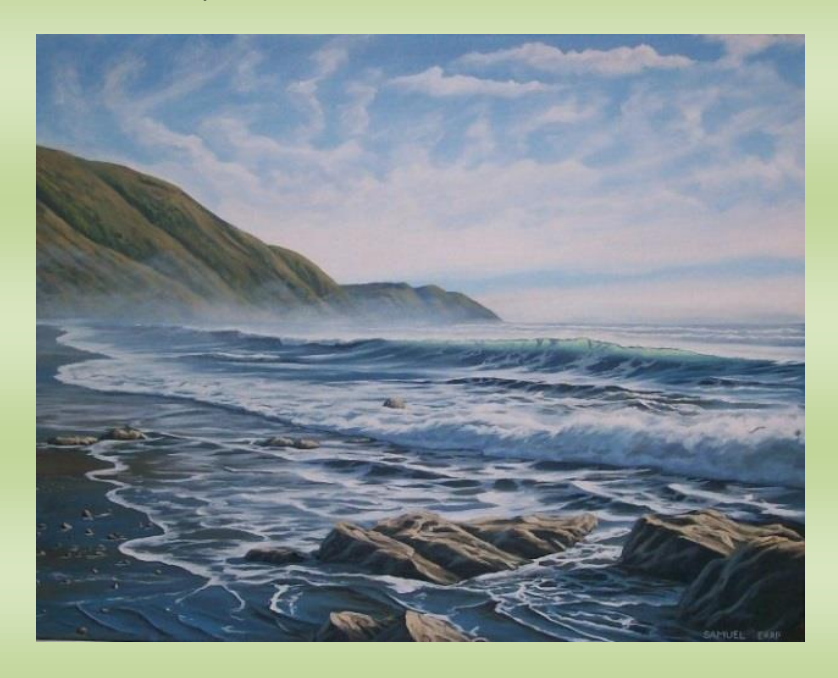
'Paekakariki' oil on canvas 700mm x 600mm $900.00