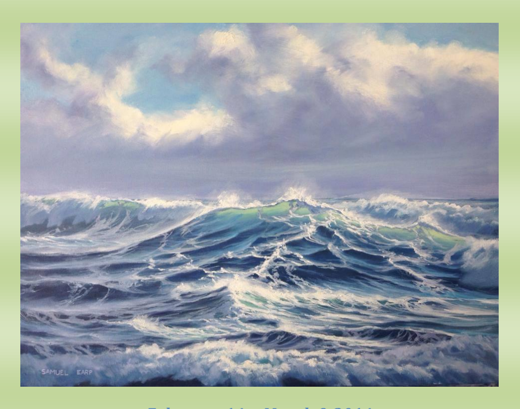
February 14 - March 9 2014

A Collection of Samuel Earp Seascapes in oil 2012 - 2013