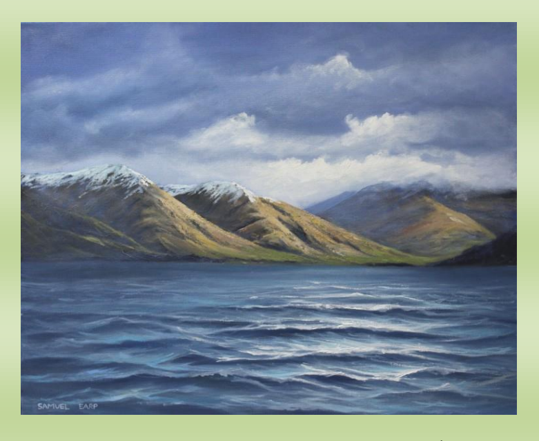
'Lake Wakatipu 2' oil on canvas 500mm x 400mm $1100.00