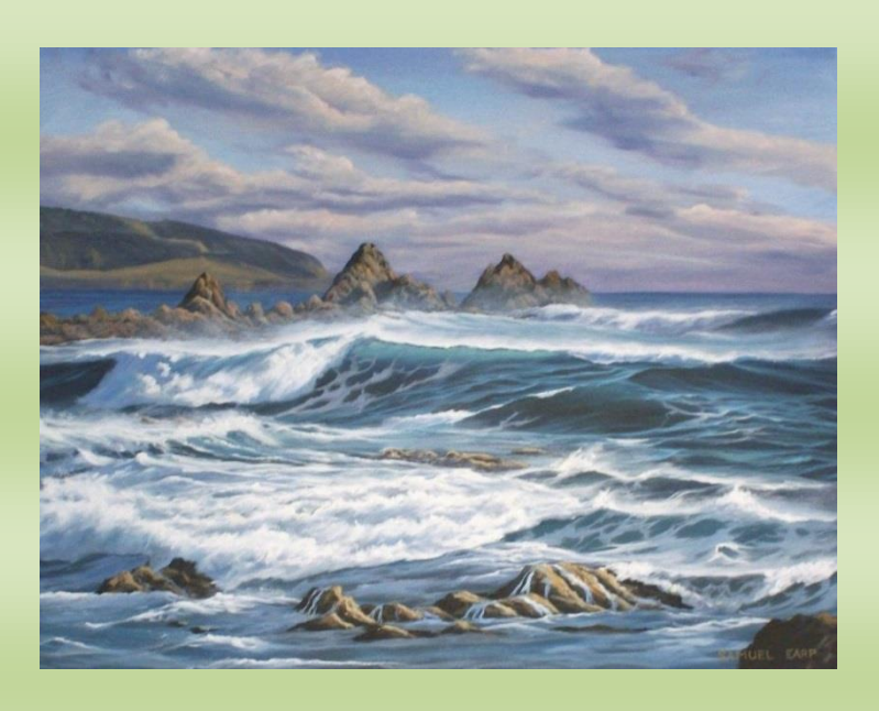
'Harbour Entrance' oil on canvas 700mm x 600mm $900.00