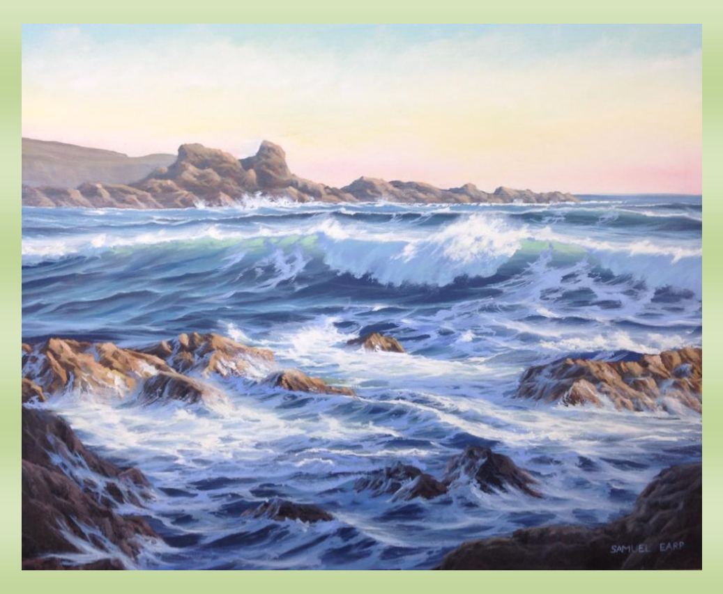
'Wave Study No 2' oil on canvas 900mm x 600mm $2200