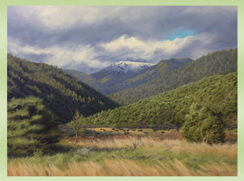
'Otaki Forks' oil on canvas 600mm x 460mm $1450.00