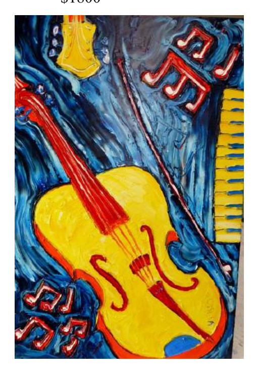
A Sniff of Paris oil on canvas 900mm x 600mm $1800

16 'Making Music' oil on canvas 900mm x 600mm $1800