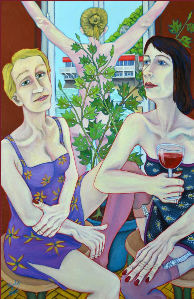
'After Spring' 900mm x 700mm